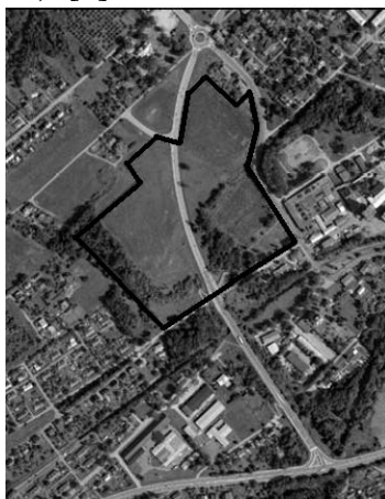
Fig.1 Sophia Spoil Heap

The Sophia spoil heap is situated in the Orlova - Poruba cadastral area in the Moravian-Silesian Region. The total area under study is 9.47 ha and is divided into 2 parts by a class II hard surface road No. 470. First mounds here were made as early as 1871 and was a total heap of stored 874,000 tons spoil rock. For evaluation of environment of Sophia spoil heap before human intervention was used materials and maps from the period prior to the 1871st. This was particularly the maps first, second and third military survey maps and the time of the so-called Theresian mapping. The reclamation of this spoil heap started in 2003 and completed in 2006. Biological reclamation consisted of planting trees: Pedunculate Oak ( Quercus robur ), European Beech ( Fagus sylvatica ), European Hornbeam ( Carpinus betulus ), Hedge Maple ( Acer campestre ), European Ash ( Fraxinus excelsior ), Small - leaved Linden ( Tilia cordata ), Black Alder ( Alnus glutinosa ), Sea buckthorn ( Hippophae rhamnoides ), Common Privet ( Ligustrum vulgare ), Viburnum ( Viburnum opulus ), Common Dogwood ( Swida sanguinea ), Hawthorn ( Crataegus monogyna ). [8]