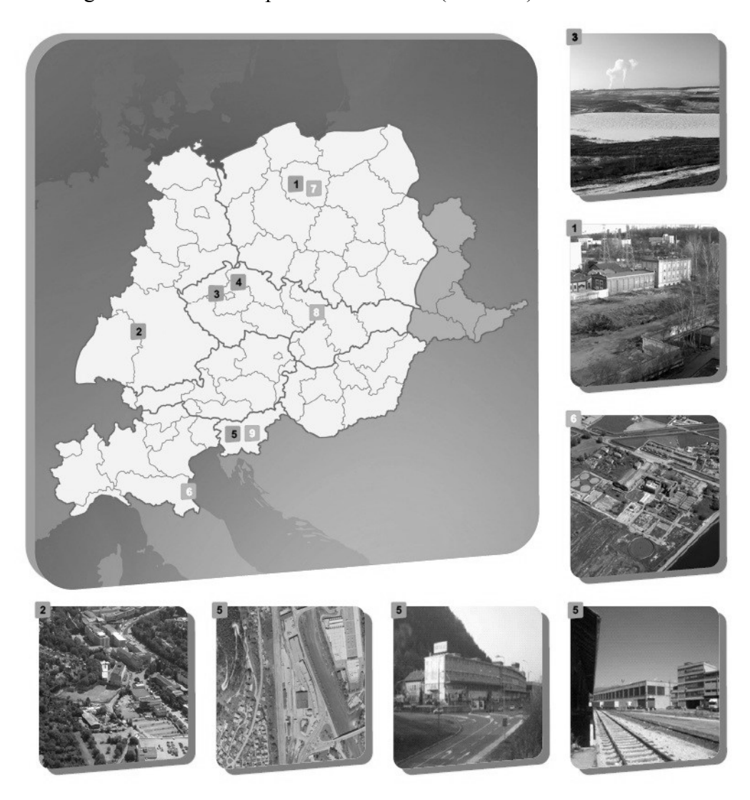
Fig. 1 COBRAMAN Project Partner location: 1, 7 – Poland (Bydgoszcz), 2 – Stuttgart; 3, 4, 8 – the Czech Republic (Ústí nad Labem, Most, Ostrava); 5, 9 – Slovenia (Kranj, Ljubljana); 6 – Italy (Ferrara) [2]

The COBRAMAN project is a result of extensive international collaboration of many subjects - universities and municipalities such as City of Bydgoszcz (Poland, Lead Partner), City of Stuttgart (Germany), The University of Economy in Bydgoszcz (Poland), City of Most (the Czech Republic), VŠB – Technical University of Ostrava (the Czech Republic), City of Kranj (Slovenia), Statutory City of Ústí nad Labem (the Czech Republic), SIPRO Country Board for Development Ferrara (Italy) and Urban Planning Institute of the Republic of Slovenia (Slovenia).