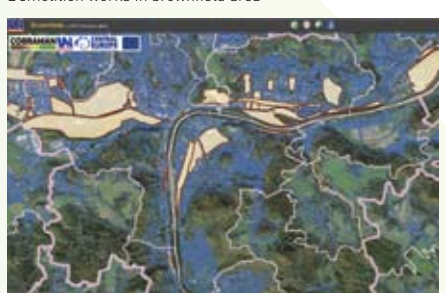
GIS as part of brownfield regeneration strategy in Ústí nad Lahem

The Ústí brownfields manager's job in the following period will be to deal with the tasks defined by the Strategy. The manager will coordinate the work on a study of the brownfields' influence on Ústí's image, on the research conducted in the residential districts facing problems connected to brownfields and on the creation of the Study on "Krásné Březno Peninsula". Another important opportunity for