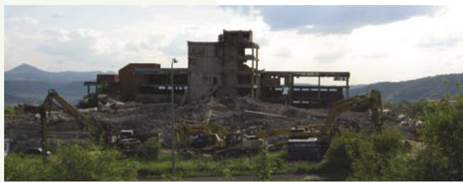
Demolition works in brownfield area

On visiting the city of Ústí nad Labem, one can notice that within the urban fabric there is a high incidence of run down and dilapidated properties and a large number of buildings, which are empty or used in an inappropriate way. All makes one think, what is the reason for this state of affairs?