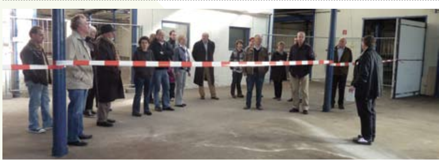
Open day at the "Schoch Area"

Brownfield Regeneration Strategies well were widely appreciated among the above mentioned public. There was a sincere interest in the COBRAMAN project partnership and its results and in the Central Europe programme that enabled such innovative activities in brownfield management in the specific European region. Attend the EXPO REAL was useful for the COBRAMAN project, especially for networking, experiencing communication with property managers and discussing financial and feasibility questions of brownfields.