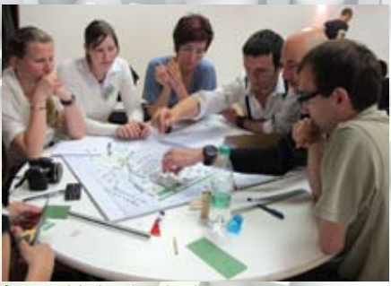
Group work in the urban planning game

In the workshops, participants were divided into three groups, where each tried to implement