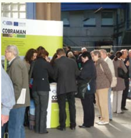
500 people visited the event

The public event was the first impulse of an open discussion with inhabitants of the districts and other interested stakeholders, which will bring in new ideas for the development of the space. In 2012 – after the end of COBRAMAN project – the process of participation will be continued by the administration of Stuttgart, the aims being higher standard and successful marketing.