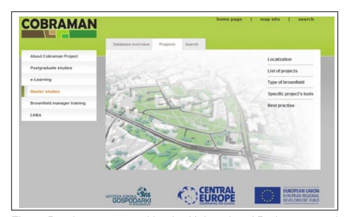
Fig. 2: Database prepared by the University of Bydgoszcz and the Technical University VSB of Ostrava.

The universities involved in the project have designed practical coaching measures and teaching materials. The structure of the BM educational path forms as follows: Gradual degree: Master study - European school for brownfield redevelopment (VSB - Technical University of Ostrava), postgradual studies Brownfield Management Economical University of Bydgoszcz, e-learning (non-graduate degree). E-learning is supposed to have 5 modules and to focus on the practical brownfield planning and management. The subjects within master study courses will be divided into compulsory and optional and shall cover inter alia: industrial landscape regeneration, fundamentals of architecture, marketing, municipal development, urban planning, brownfield management, industrial architecture, case studies, information systems at landscape, cultivation greenery setting and maintenance, risks in brownfield redevelopment, socio-economical assessment of brownfields, environmental law modelling and territorial planning, industrial heritage protection, investment processes and brownfields regeneration, economical tools for brownfield regeneration.